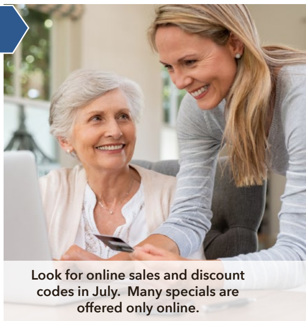
Look for online sales and discount codes in July. Many specials are offered only online.

Furniture and home goods are traditionally on sale around Fourth of July.