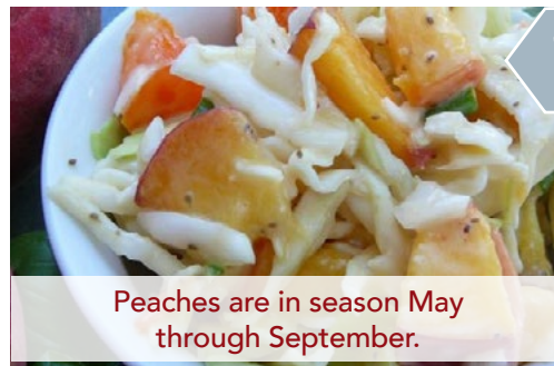
Peaches are in season May through September.

Why are gulls named seagull? If they were by the bay, they'd be bagels!