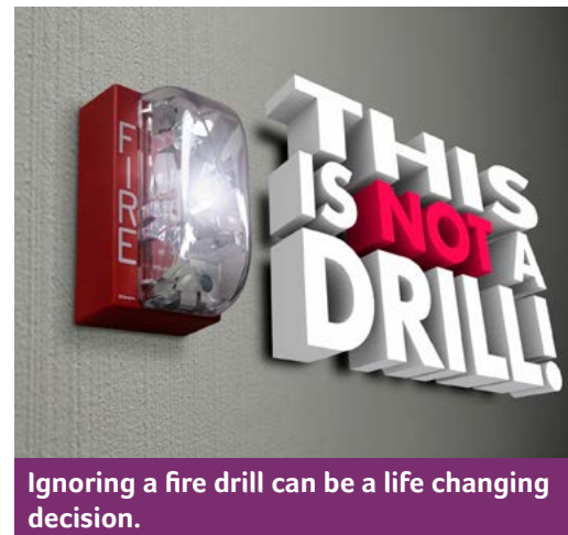
Ignoring a fire drill can be a life changing decision.

While this was an exceptionally tragic case, blocked exits and locked doors are possible to find in any location. Usually, these situations are easy to remedy and