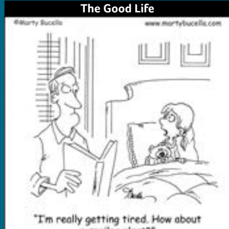
a spoiler alert?"